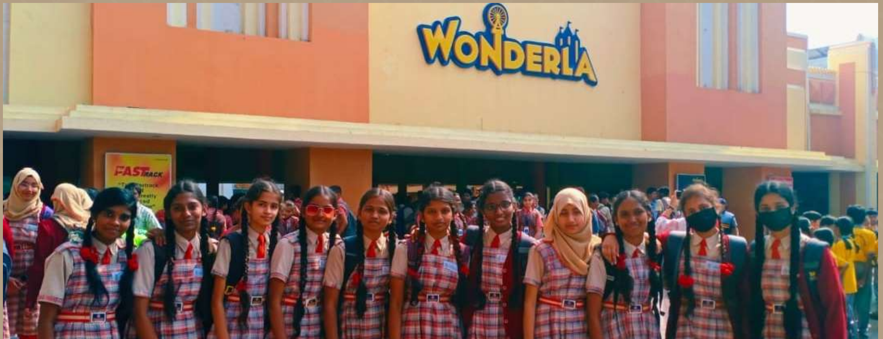
Grade 8 Diamond Students at WonderLA